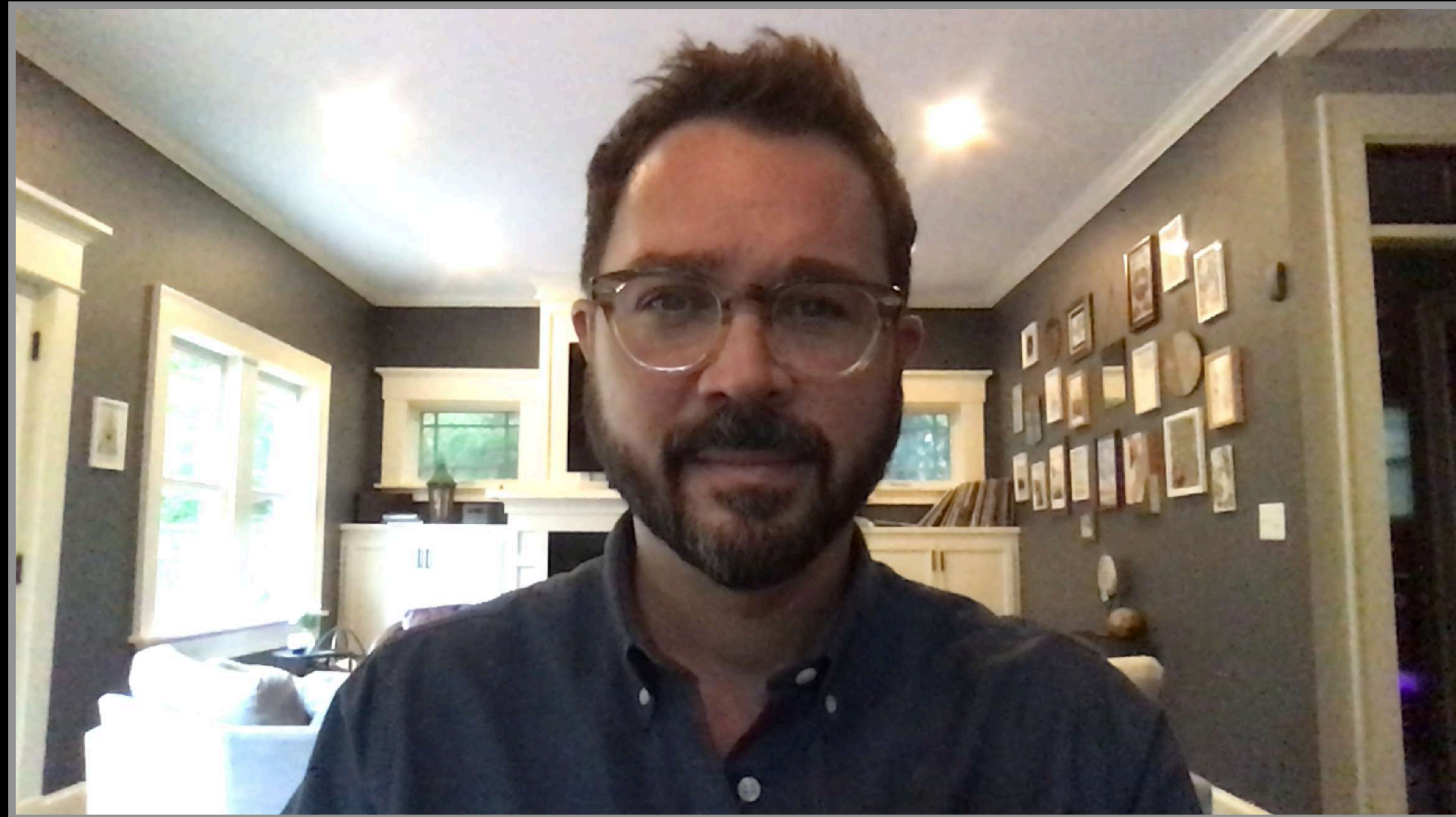
Standard built-in laptop webcam