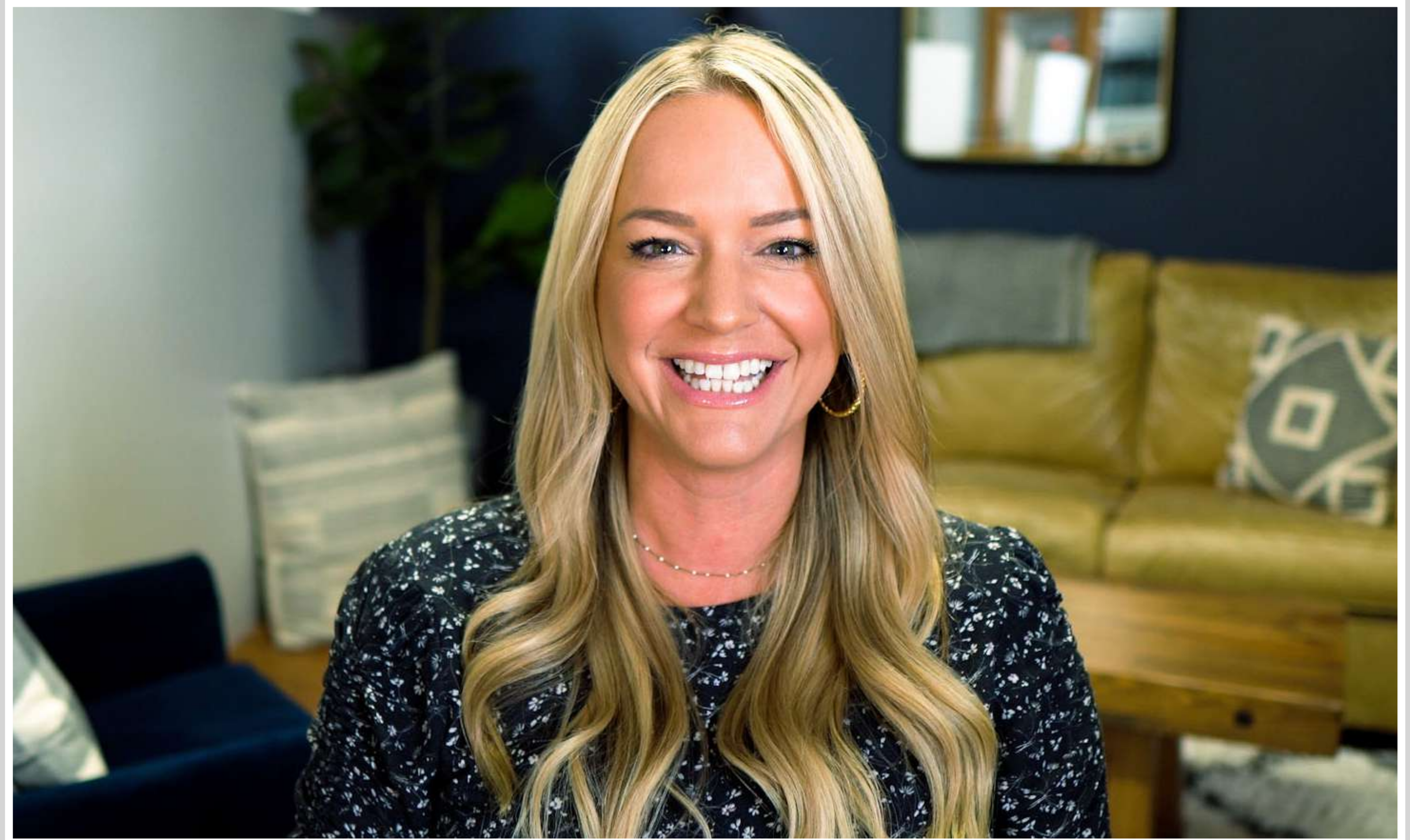
Sample screen grab from Pro-Kit video footage

A comfortable and focused speaker makes eye contact, and eye contact equals audience engagement