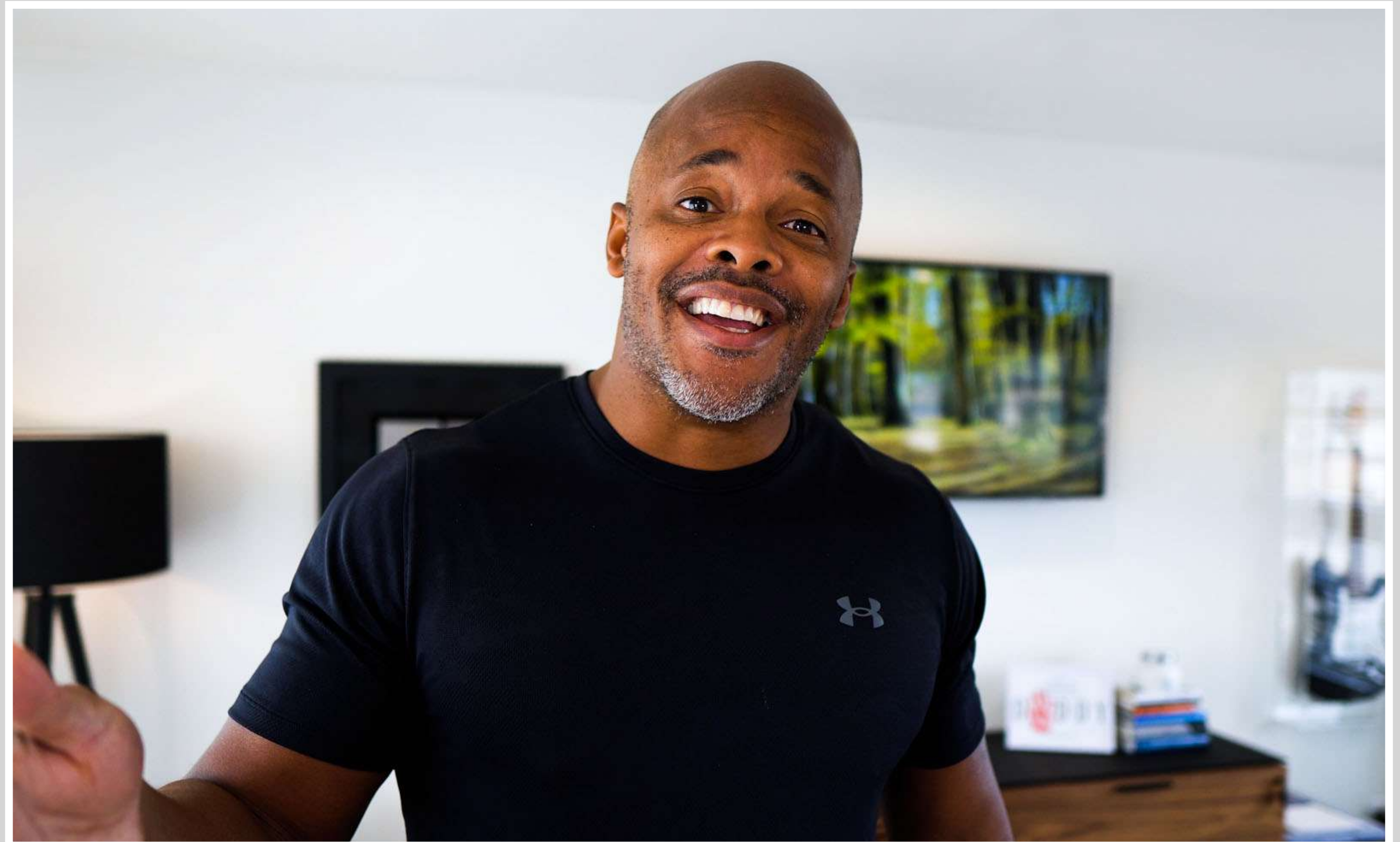
Sample screen grab from B-Kit video footage